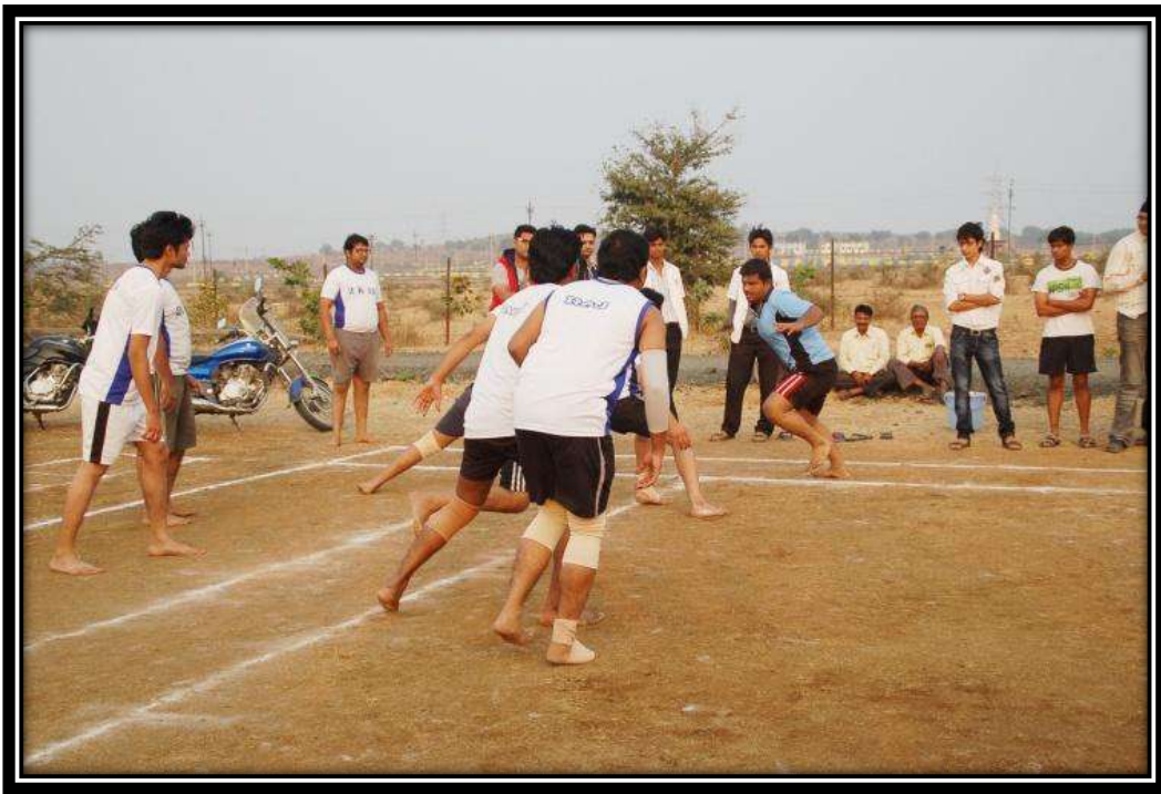
Free sharing of university resources with Local Communities- Sports Facilities