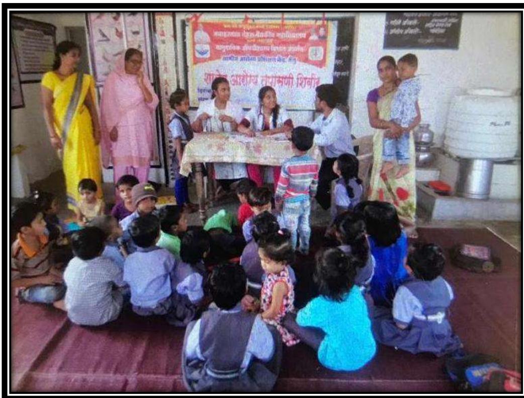
Free Sharing of Medical Facility to school Children – Educative Program