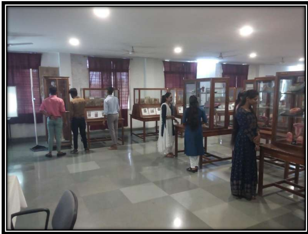
Free sharing of university resources with Local Communities – Museum