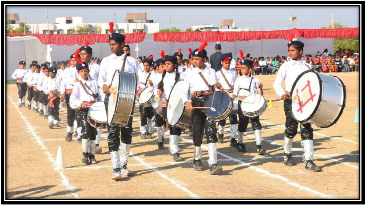
Free sharing of sports ground to local school

A handwritten signature in black ink, appearing to read "Manoj".