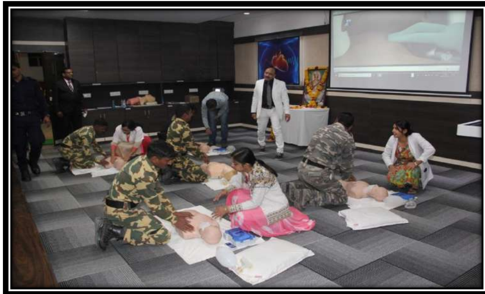
Free training of Cardio pulmonary resuscitation (CPR) for Para-Military Personnel